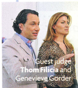
Guest judge Thom Filicia and Genevieve Gorder