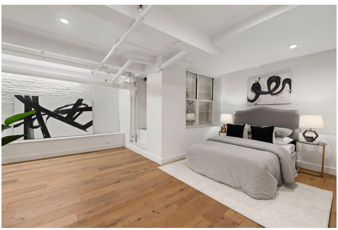
The second bedroom is much more cozy. Richard Caplan