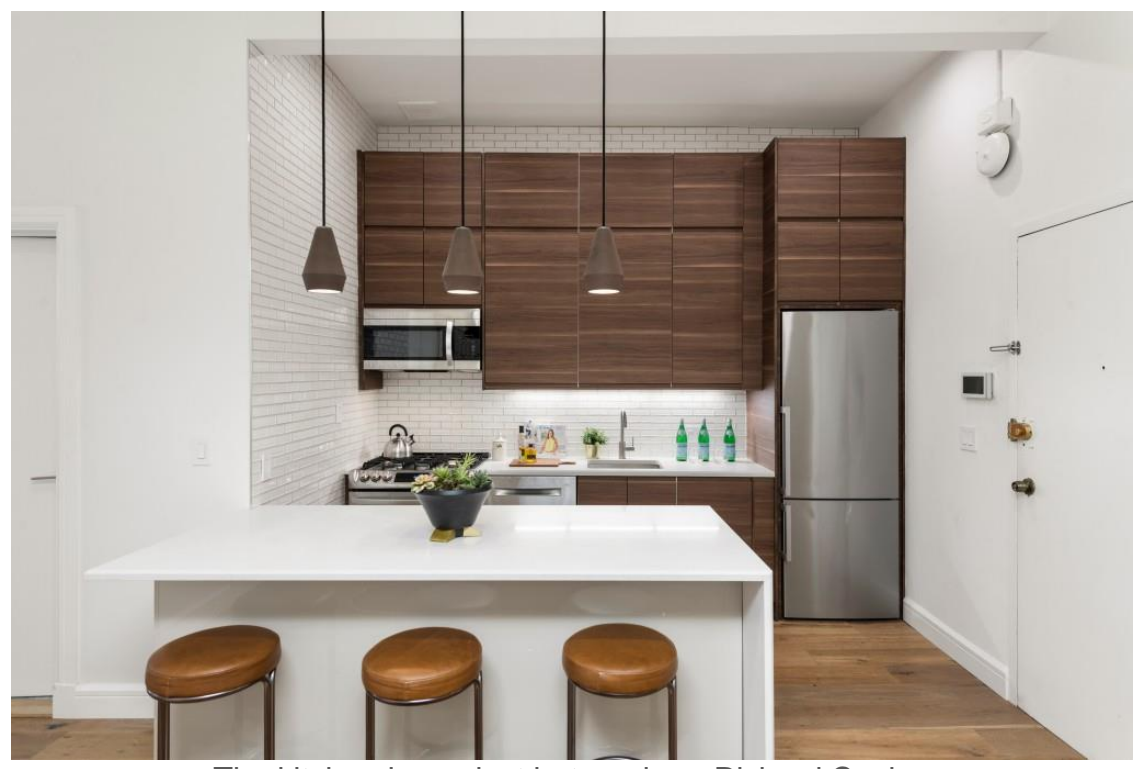
The kitchen is modest but modern. Richard Caplan