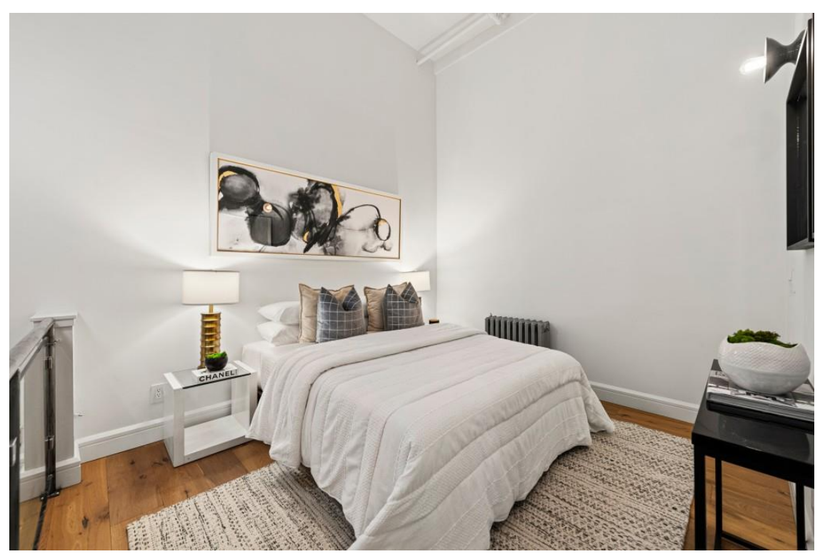
The main bedroom is super spacious. Richard Caplan